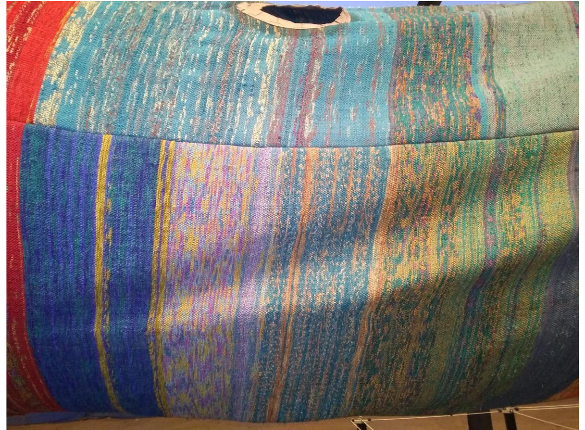
Tunnel for kids made from recycled garment waste using hand weaving