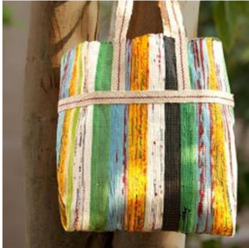
Bag from recycled plastic waste by women hand weavers in Western India