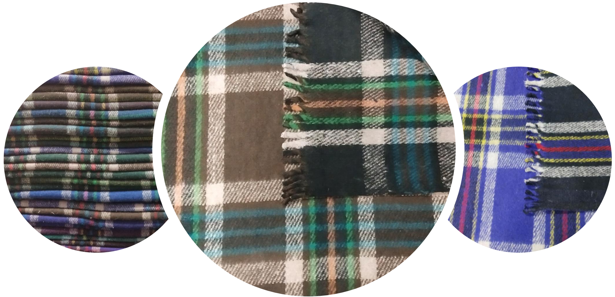
Double Face Wool Blankets